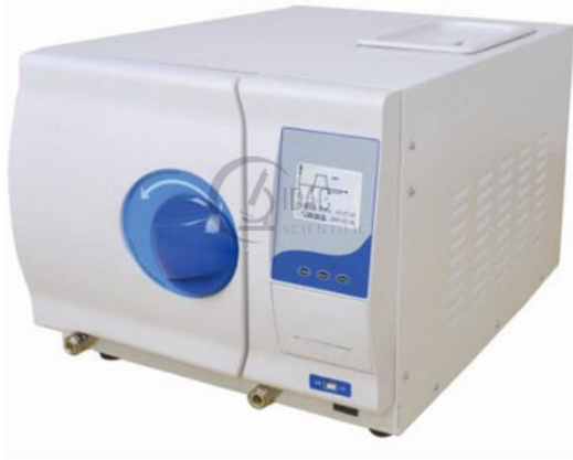
Table Top Autoclave